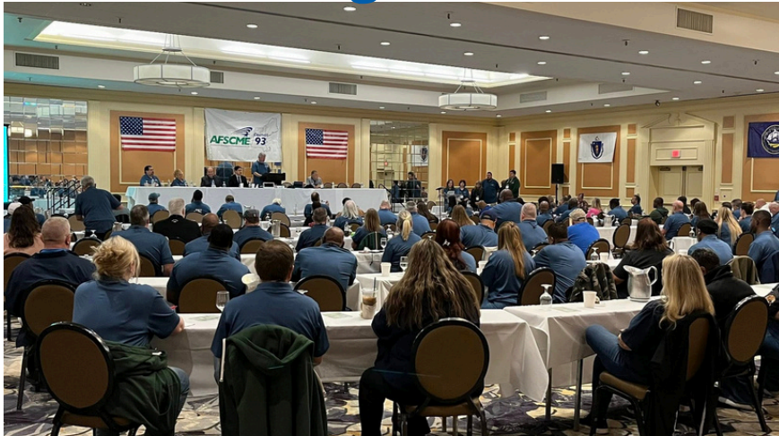
Delegates to the 27 th Biennial Convention in Danvers, MA

Danvers, MA- In November, leaders, delegates, and rank and file members from across our four-state region gathered for the 27th Biennial AFSCME Council 93 Convention to come together and set the policies, agenda, and goals of our Union for the next two years.