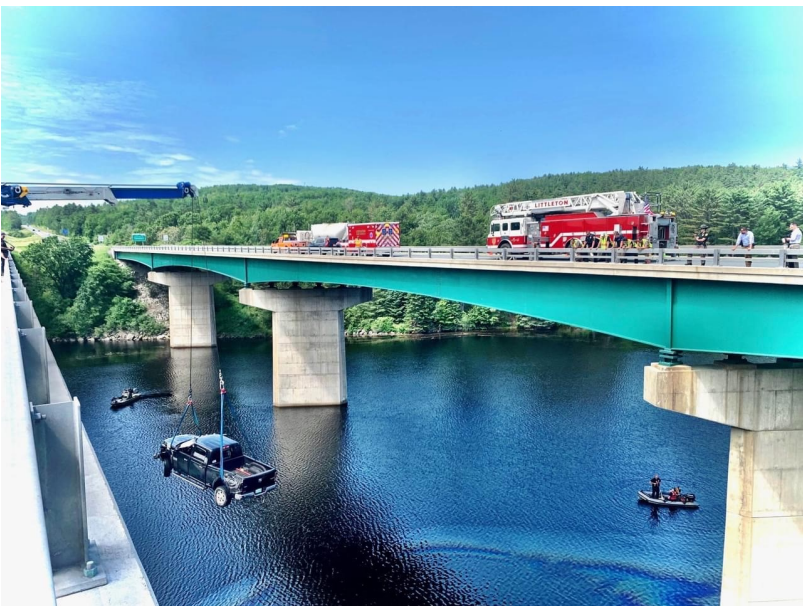
Left: Truck removed from Connecticut after a fatal motor vehicle crash.