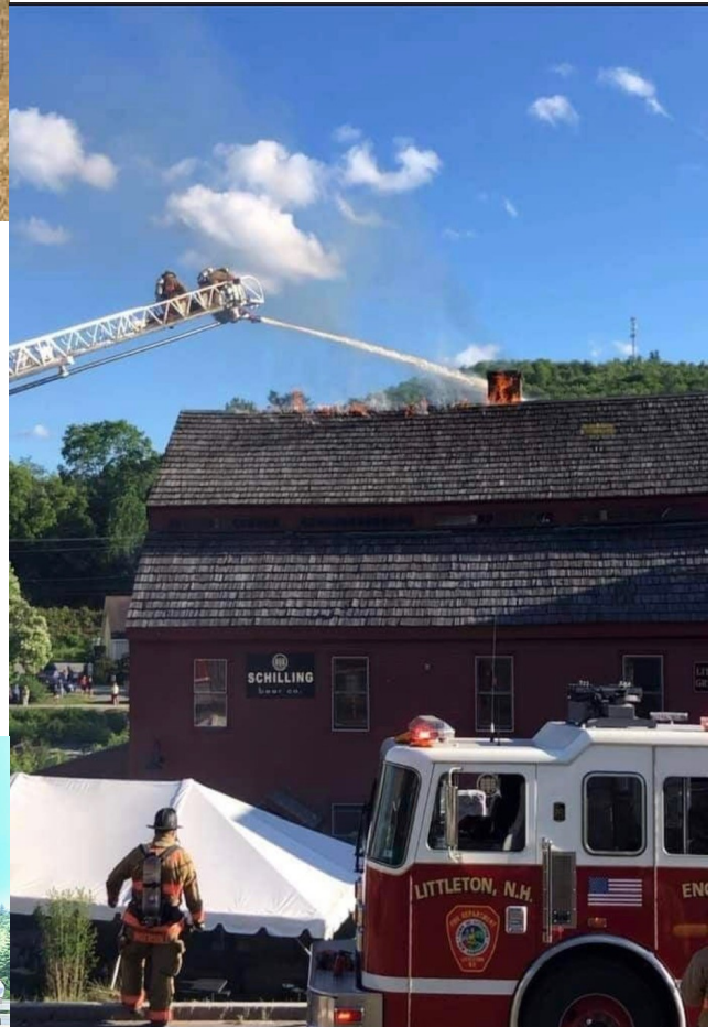
Right: A fire on the roof at Schillings is extinguished utilizing the aerial ladder.