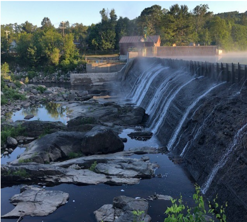
Left: Aphthorp Dam operated by White Mtn. Hydro.

Littleton has 2 hydro electric dams in the town. The largest of which is the Moore on the Connecticut River that borders New Hampshire and Vermont. Moore Dam is utilized in the summer months for various recreational activities. Littleton Fire is prepared to respond via land and water to assist those in distress. Moore is the largest Hydro-electric producer of power in New England.