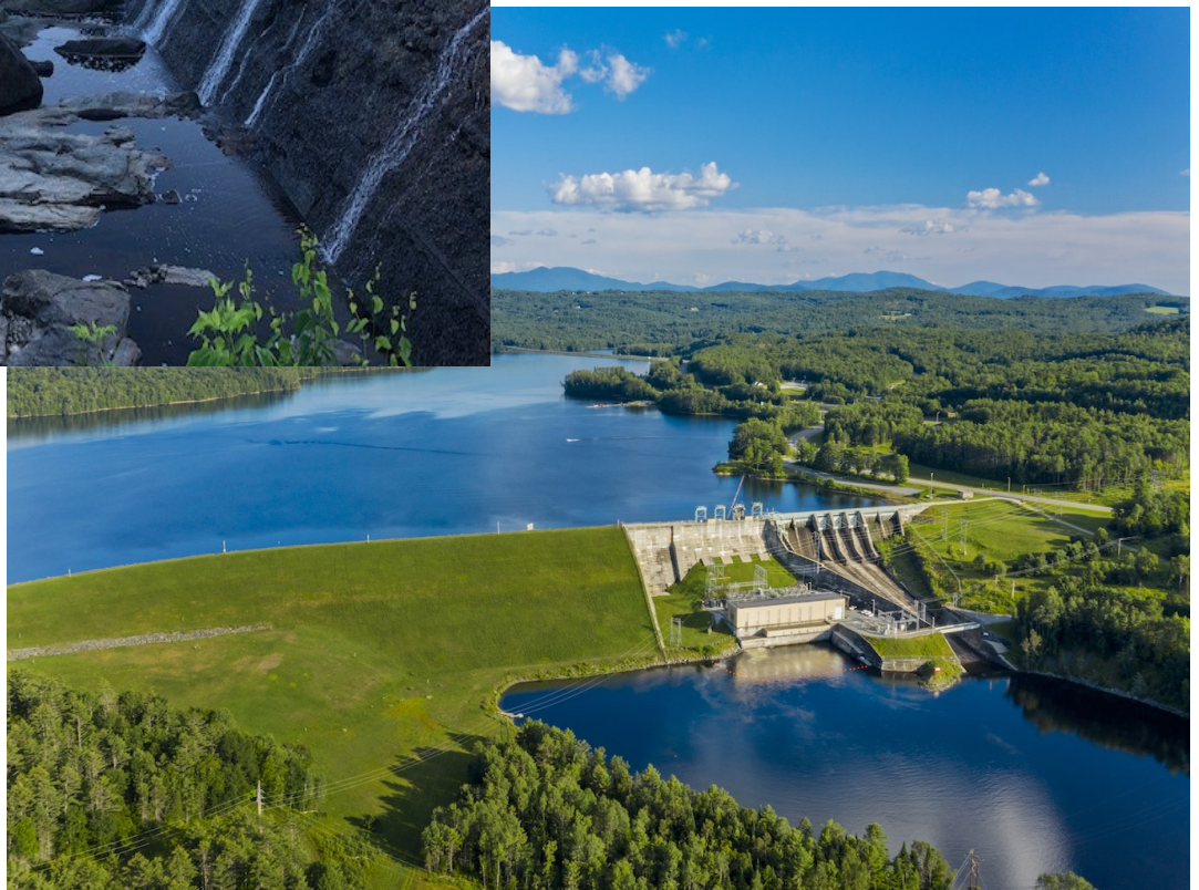
Right: Moore Dam and Reservoir.